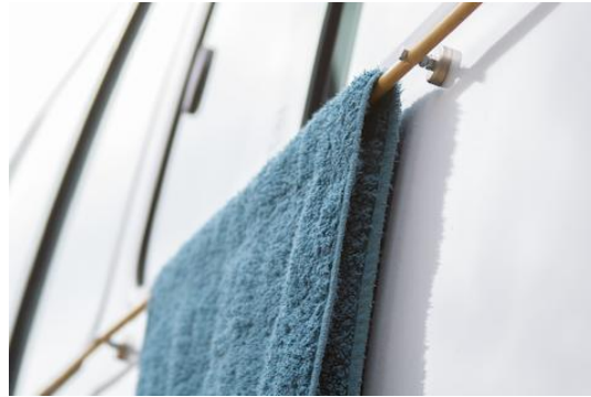
You can also attach the bamboo rail on the outside of the car to try laundry.