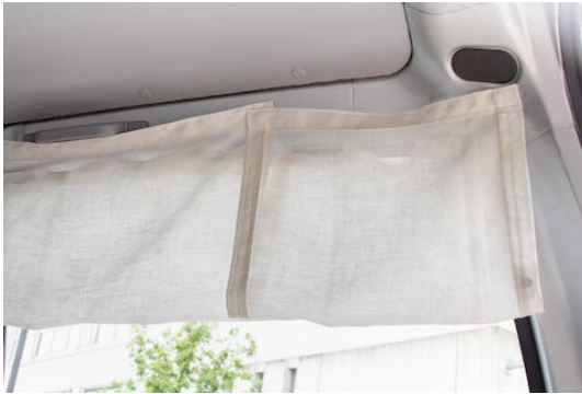
Thanks to the sewn-in magnets, the car curtains can easily be folded upwards.