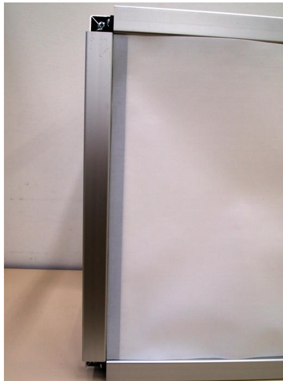
Final result with no offset