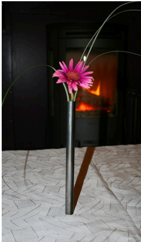
The vase seems to stand stable on the table on its own.